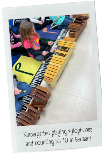
Kindergarten playing xylophones and counting to 10 in German!

Last month we made passports and 'traveled' to our first country of the month - Germany! We learned all sorts of fun facts and songs about Germany and even got to virtually meet Greta (a German Foreign exchange student) and ask questions about Germany!