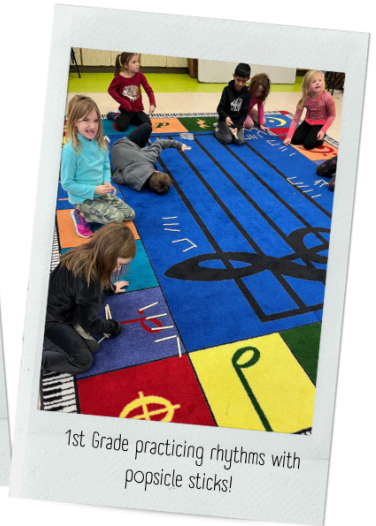
1st Grade practicing rhythms with popsicle sticks!